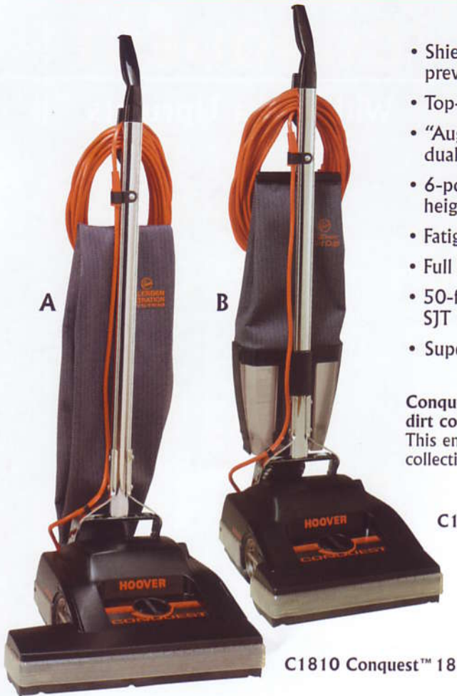
C1810 Conquest™ 18