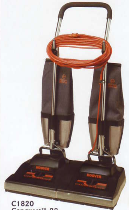
C1820 Conquest™ 28 Wide Area Upright

The obvious choice where large carpeted areas must be cleaned with efficiency. The E-Z Empty™ dirt cup collection systems are standard and included on this model only. (Ask your dealer about cloth bag option.)