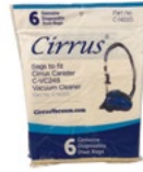
C-14020 Disposable VC248 Canister Bags 6 pk