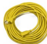
C-30008 Extension Cord Yellow each