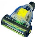
FA-57015 Pet Tool CR79/99/9100 Uprights each