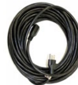
FA-3092-3 Extension Cord Black each