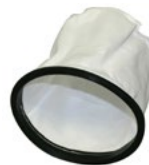
DC-1225 Cloth Bag 6 qt Plastic 120 Backpack each