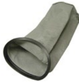
DC-1226 Cloth Bag 10 qt Aluminum Backpack each