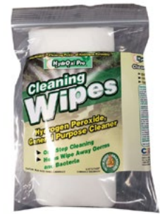
HydrOxi Pro Cleaning Wipes 35 ct