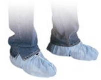
Shoe Covers, Booties 100 box (50 pair)