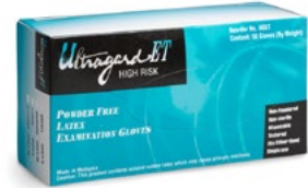
Glove, Latex Powder Free 50 box