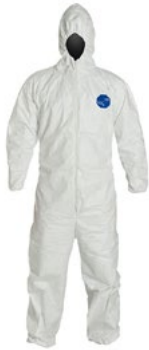
Coverall, Tyvek with Hood Assorted Sizes Sold Each

JS-8130 - Medium JS-8133 - Large JS-8134 - Extra Large JS-8135 - 2X Large