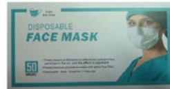
Ear Loop Face Masks 3-ply 50 pk