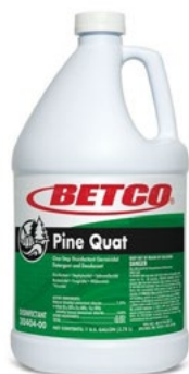
Betco Pine Quat Pine Cleaner, Disinfectant and Deodorant 1 gal