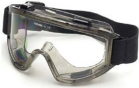
Elvex Chemical Splash Protection Goggles