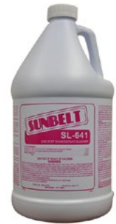
Sunbelt One-Step Disinfectant Cleaner Concentrate 1 gal