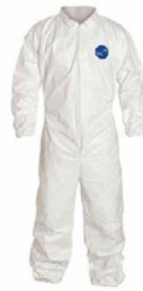
Coverall, Tyvek with Elastic Assorted Sizes Sold Each

JS-8161 - Large JS-8162 - Extra Large JS-8163 - 2X Large