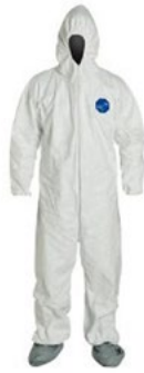
Coverall, Tyvek with Hood & Booties Assorted Sizes Sold Each

JS-8137 - Extra Large JS-8138 - 2X Large JS-8139 - 3X Large