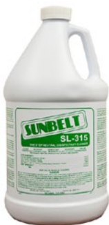
Sunbelt One-Step Disinfectant Cleaner Concentrate 1 gal