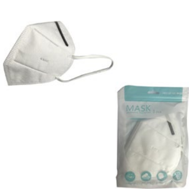
KN95 Respirator Mask (non-valve) 5 pk