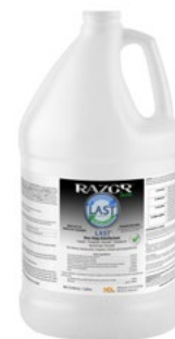
LAST Disinfectant and Antimicrobial Coating 1 gal