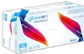
Glove, Nitrile Powder Free 90 -100 box

JS-8117 - Large 100 pk JS-8118 - Extra Large 90 pk