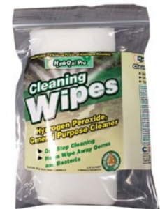
HydrOxi Pro Cleaning Wipes 35 ct