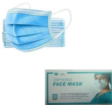
Ear Loop Face Masks 3-ply 50 pk