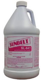
Sunbelt One-Step Disinfectant Cleaner Concentrate 1 gal