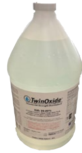
TwinOxide Commercial Strength Disinfectant