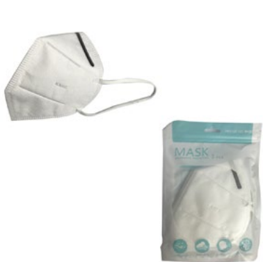
KN95 Respirator Mask (non-valve) 5 pk