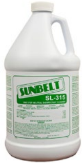
Sunbelt One-Step Disinfectant Cleaner Concentrate 1 gal