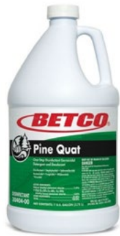
Betco Pine Quat Pine Cleaner, Disinfectant and Deodorant 1 gal