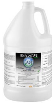
LAST Disinfectant and Antimicrobial Coating 1 gal