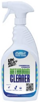
Unbelievable Bathroom Cleaner 32 oz